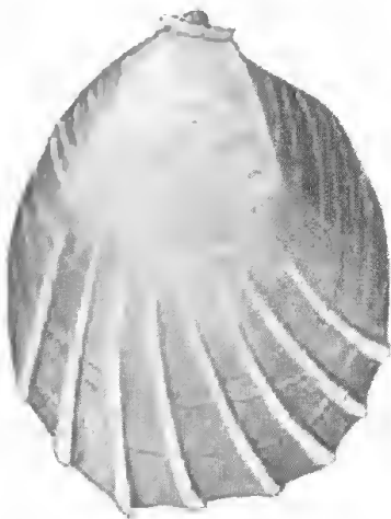
Fig. 1. Philobrya tardiradiata sp. nov.

Loc. Backstairs Passage, 20 fathoms (type); Beachport to Ellensbrook, 20 to 120 fathoms.